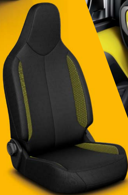
Beam black seats with yellow inner bolsters and stitching