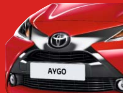
Contrasting front x, x-tension and rear difusser