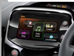
x-touch multimedia system