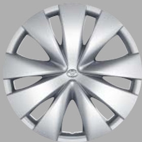
14" steel wheels with wheel caps (9-spoke) Standard on x