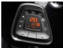
Automatic air conditioning