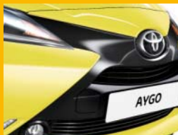
Gloss Black front-x contrasts with Yellow Fizz exterior