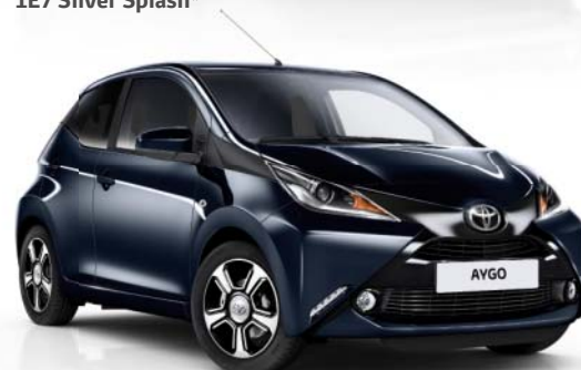
8R7 Deep Blue Buzz*