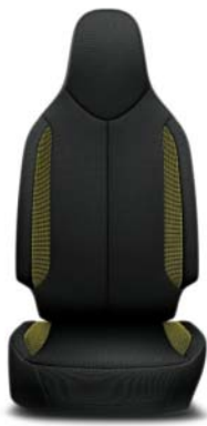
Beam black fabric with yellow inner bolsters and stitching Standard on x-cite