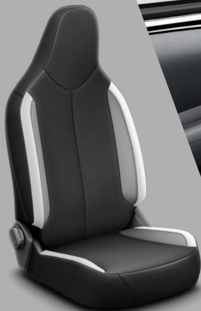
Gleam dark grey fabric seats with light grey and white bolsters