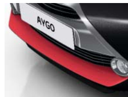
Colour accents to front, rear, side and roof