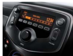
Audio system with USB and aux-in connections