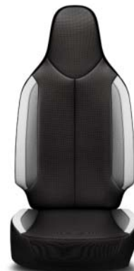
Glam dark grey fabric with light grey and white bolsters Standard on x-play , x-press and x-style