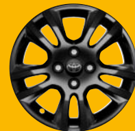
15" black alloy wheels with black centre caps