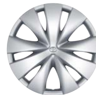
14" steel wheels