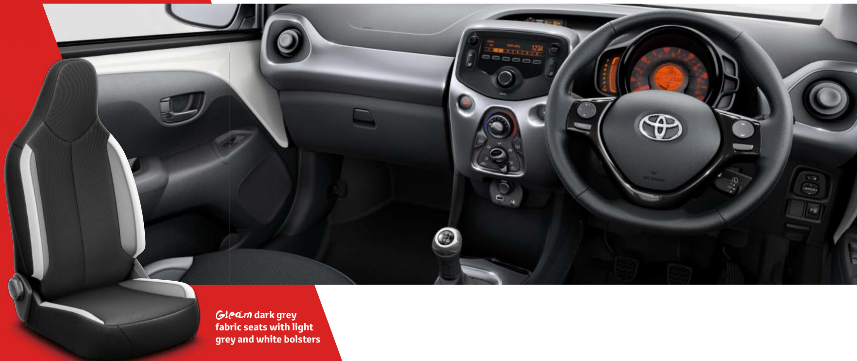
Glam dark grey fabric seats with light grey and white bolsters