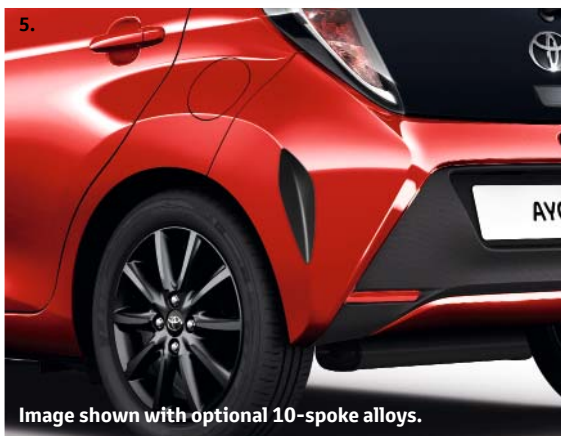
Image shown with optional 10-spoke alloys.