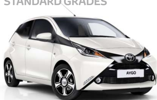
068 White Flash*