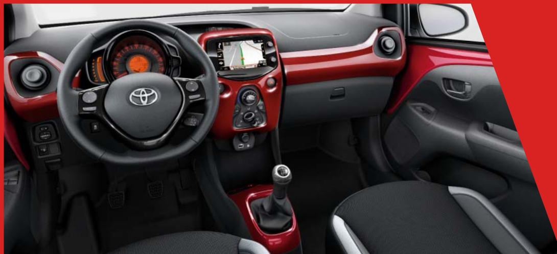
Image shown is not to UK specification and is used for illustrative purposes only. Model shown is x-play in Red Pop with optional x-touch multimedia system and optional x-nav system.