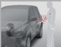
Smart Entry and Push-Button Start