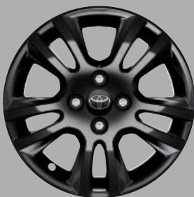
15" Gloss Black alloy wheels (5-double-spoke) Standard on x-cite