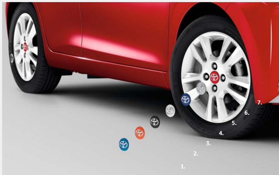
Small centre cap