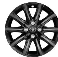
15" Gloss Black alloy wheels (10-spoke)*