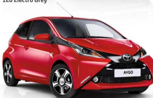
3P0 Red Pop