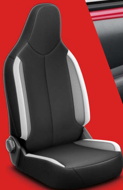
Glam dark grey fabric seats with light grey and white bolsters