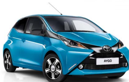
8W9 Cyan Splash* (only available on x-clusiv)