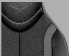
Vogue black and anthracite leather*