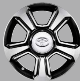
15" black machined-face alloy wheels (5-spoke) Standard on x-clusiv

* Driver's and passenger seat facings are genuine leather; other components, including rear seat facings are faux leather.