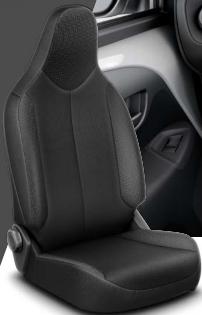
Mod black and grey fabric seats