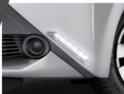
LED daytime running lights add style