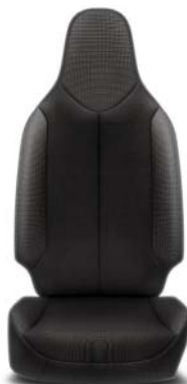
Mod dark grey fabric Standard on x