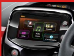
x-touch multimedia system