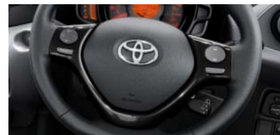
Steering wheel controls for both audio and telephone