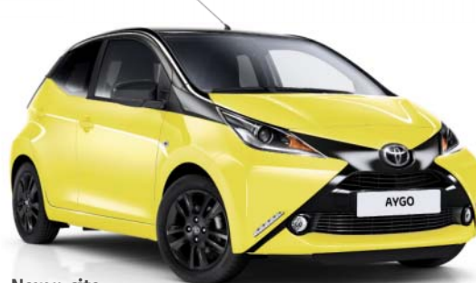
New x-cite Available in 5B9 Yellow Fizz⁹