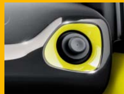
Yellow Fizz air vent surrounds create an interior highlight