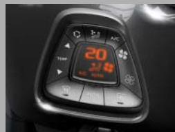
Automatic air conditioning