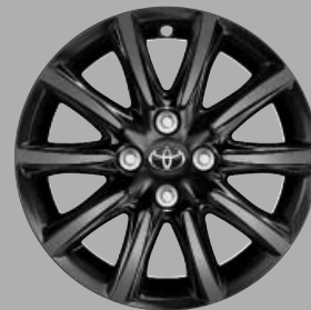
15" Gloss Black alloy wheels (10-spoke) Standard on x-press and x-style §