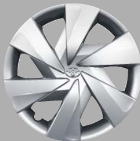
15" steel wheels with wheel caps (6-spoke) Standard on x-play