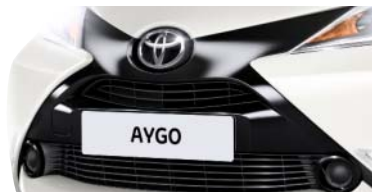
Premium Gloss Black front-x