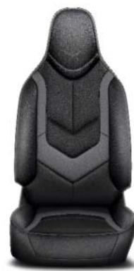
Vogue black and anthracite leather* Standard on x-clusiv