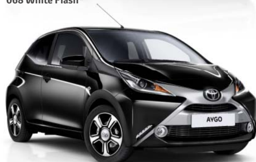
211 Bold Black* (not available on x)