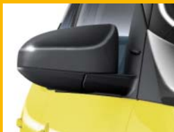
Exterior mirrors in black finish