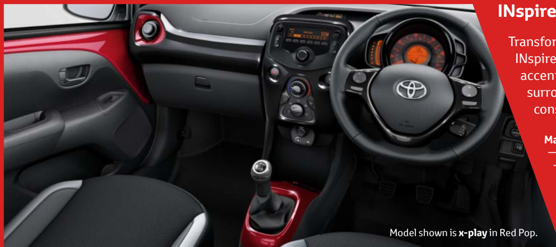
Model shown is x-play in Red Pop.