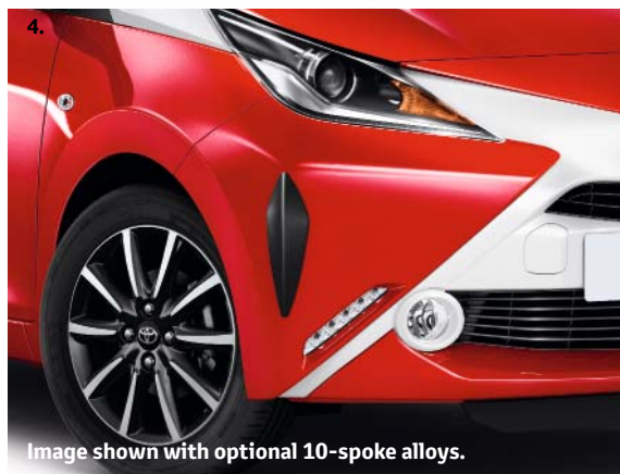
Image shown with optional 10-spoke alloys.