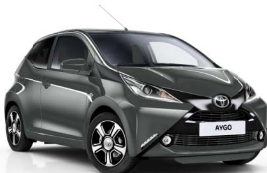
1E0 Electro Grey*