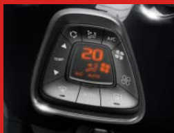
Automatic air conditioning