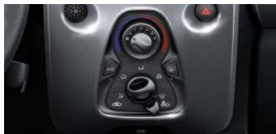
Air conditioning keeps you cool