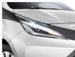
Projector headlights with LED tracer lights