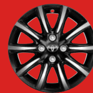
15" black machined-face alloy wheels (10-spoke)*