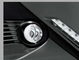
Front fog lamps for improved visibility