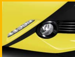
Front fog lamps for extra visibility