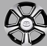
15" machined-face alloy wheels with silver centre cap