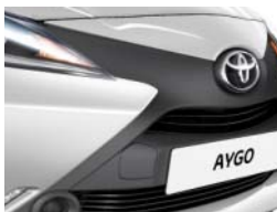
Black carbon front-x