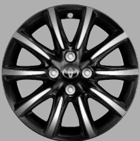
15" machined-face alloy wheels (10-spoke) Standard on x-press and x-style §