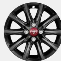
Gloss Black or Matt Black (Gloss Black shown) §