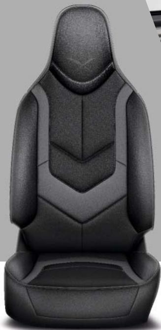
Vogue black and anthracite leather*