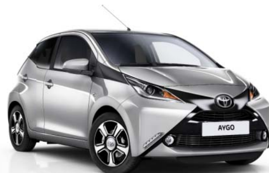
1E7 Silver Splash*