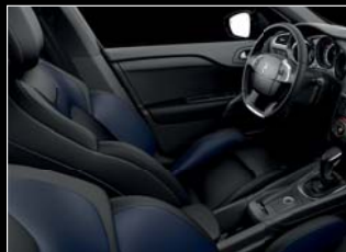
Black and Sapphire Blue leather pack