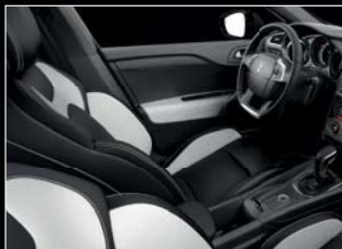
Black and White leather pack