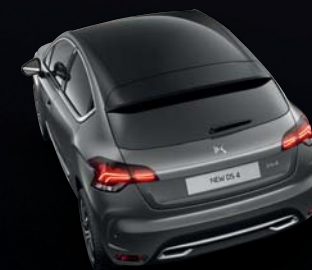
Perla Nera Black (M)