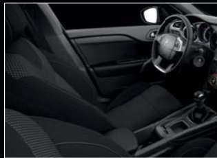
Black Lacina cloth