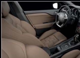
Habana Semi-Aniline leather pack with DS embossing