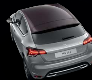
Whisper Purple (M)