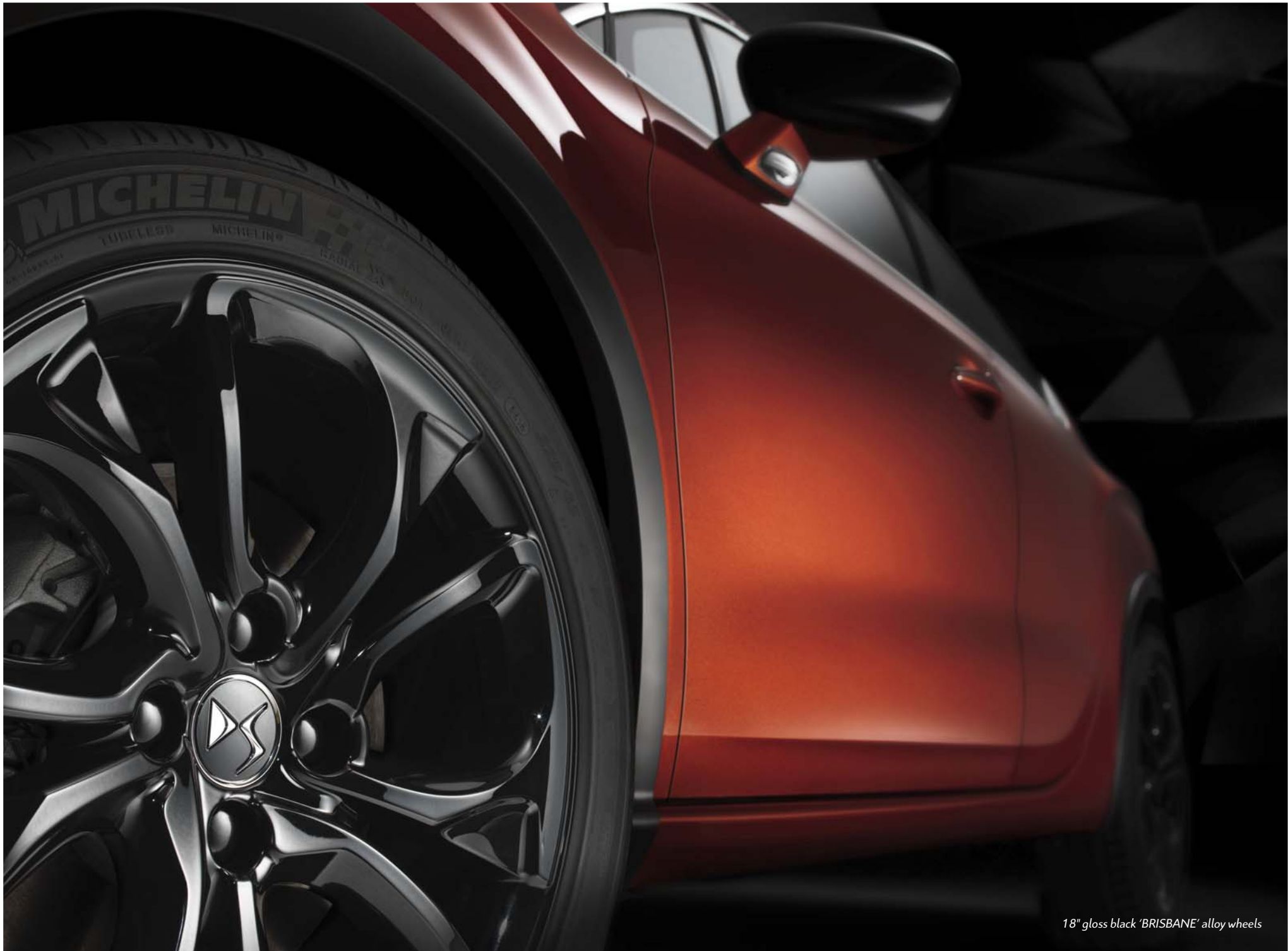
18" gloss black 'BRISBANE' alloy wheels