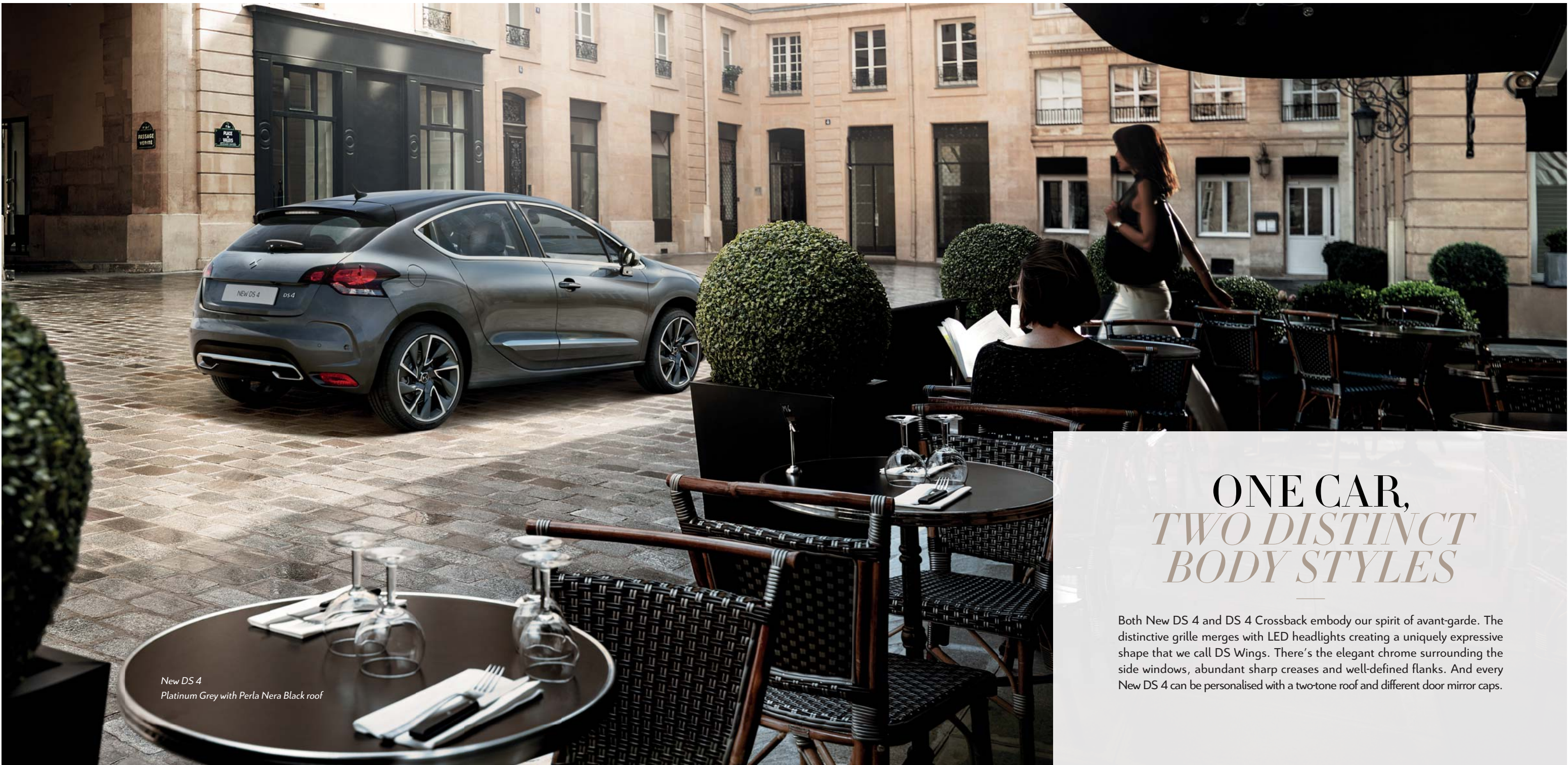
New DS 4 Platinum Grey with Perla Nera Black roof