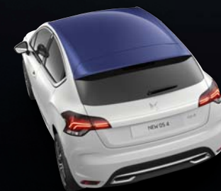
Virtual Blue (M)