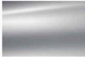
Cool Silver (M)