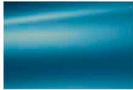
Karnar Blue (M)