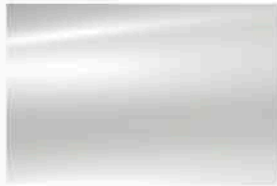
Pearl White (P)