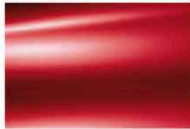
Chili Red (M)